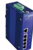
OFFSHORE OIL PLATFORM/RIG Industrial Isolated Serial Repeater Model# 4850PDRi-PH