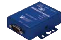
MACHINE CONTROL Modbus Ethernet/Serial Gateway Model# MESR901